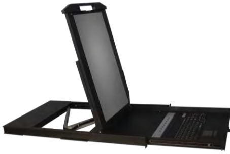
Lift the display