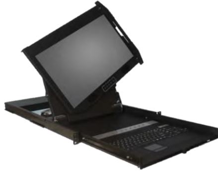
Display rotate to the right